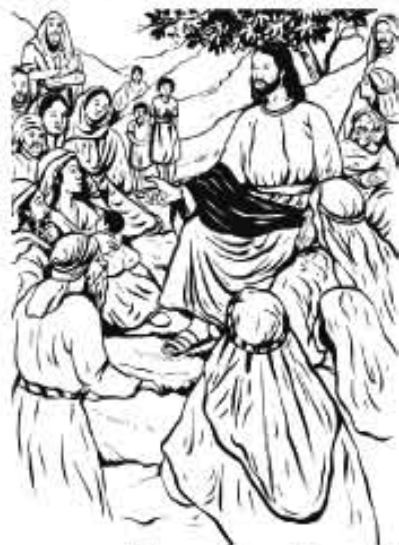
Jesus preaching among the people

God Himself is love. He loved the world and sent His only son Jesus Christ into this world, so that man can be saved through Him. Lord Jesus Christ emptied Himself. He took the role of a servant. Being in the form and kind of man He was born in the womb of Virgin Mary by the power of Holy Spirit. He gave man the word of salvation. Being innocent Himself He sacrificed Himself on the cross for sins of other people. By being resurrected He gave us too a new life in participation of resurrection. His whole life is quite a mystery. In this chapter we will discuss some aspects of the mystery of His life. Besides we shall know about the beginning of His public life till his entrance into Jerusalem.