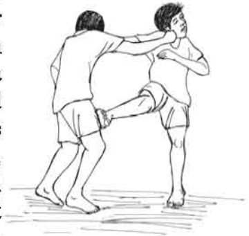
Quarrel due to anger

4. Anger: To get angry at something is called anger. When one gets angry, the person cannot control his/her temper. Not only that, by getting angry, the person can cause harm to others also. We hear it said that when a person gets angry, he/she become ferocious like a wild animal. We also notice that when we become angry, we spoil the environment, utter foul words, break objects, and even hurt others. In some cases one can even kill another due to extreme anger. But it is also true that even after getting angry and harming others, one can understand his/her fault and repent.