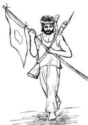
Freedom fighter of Bangladesh

English poet Samuel Johnson said about patriotism to be "The last shelter for the depraved person." He wanted to mean that, everybody needs a shelter even a criminal or a depraved person. And that shelter is his mother land, the land of one's own.