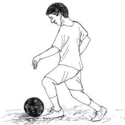
Take care of body by exercise

Taking care of the human body: Taking care of the human body which is the blessing of God is earnestly necessary. Decoration of the body in extravagance or using costly materials does not imply the taking care of human body. More importantly keeping the body clean, taking regularly necessary food, taking proper medical treatment when sick, wearing suitable dress in accordance with weather, doing limited labour, physical exercise and rest are specially remarkable. Along with the looking after the body, the sacredness of the body should be taken care of. In many respects, man abuses the use of human body. For instance, they become addicted to different types of drugs; instead of