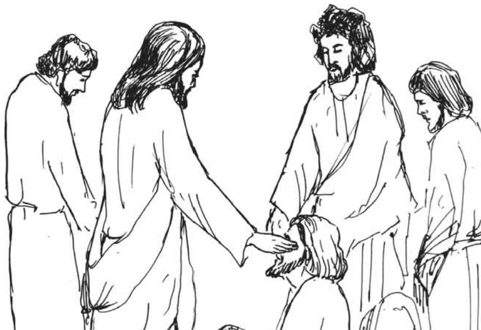
Jesus as Healer

We know a good number of miracles of our Lord Jesus Christ described in the Holy Bible. He performed these miracles during his proclamation time. He proved his strength and power through these works. People were astounded observing these great deeds because they had never seen it before. In this chapter we shall deepen our faith on Jesus by thinking and meditating upon the miracle works of our Lord Jesus Christ.