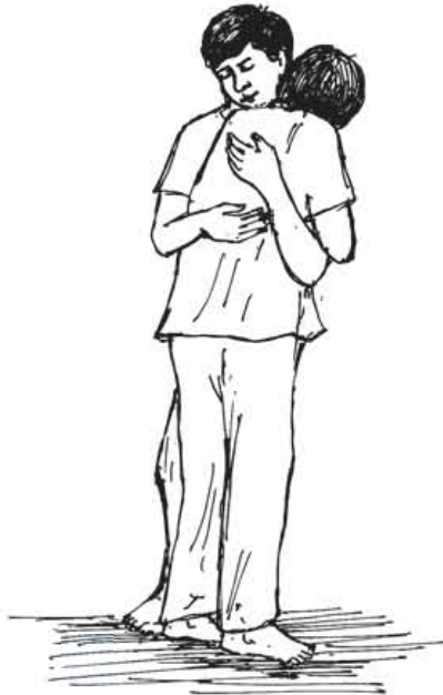
Forgiveness and reconciliation

Forgiveness, endurance and patriotism are not only social and human but also religious value. It is better to do any work with forgiveness in mind. Endurance brings maturity in our, thought, manner and action. Patriotism strengthens our minds to do something good.