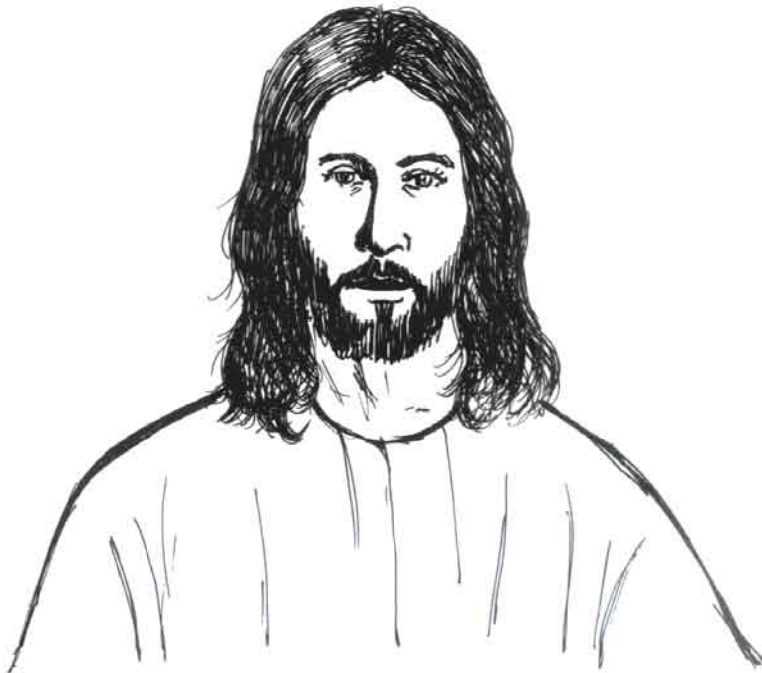
Jesus Christ, Son of God

God, the Father, loved the world so much that He sent his only Son into this world. Father's desire is to save the world from fall through His Son. Jesus is the one anointed by the Father, Christ the Saviour and the Lord of all nations. Through Him the humankind were saved and received the promise of eternal life. He is the true God and yet true Man. We shall try to know more about him in this chapter.