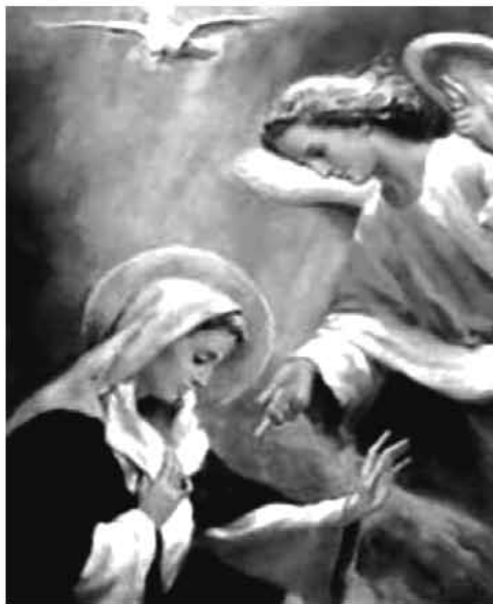
The angel's message to Mary

In spite of man's sins and going away from God, yet God's love has not decreased a little. He gave word to man that He will send a savior. Mary played an important role in realizing God's plan. Mary's response to God's call is an inspiration for our life. We will read this chapter in depth of our heart with deep faith and piety and we will try to feel the call of God in our heart and try to respond.