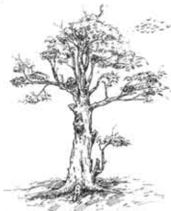
Kingdom of God is like a tree

b. Jesus compares the Kingdom of God to the Yeast. Yeast should be mixed up till it all is leavened.