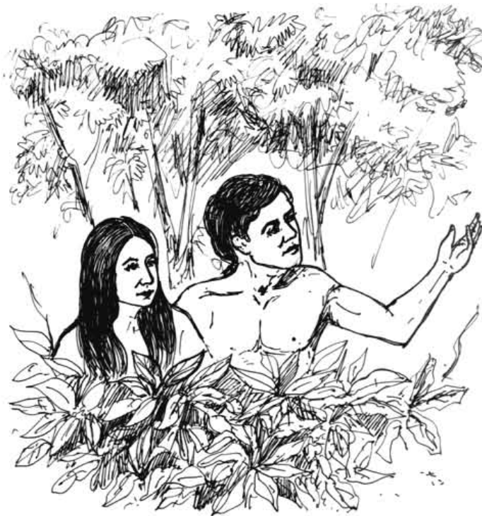
The greatest creation human being

The Creator God has created everything. All His creations are paramount. Every creation reveals the magnitude of God. The creation of God has a focal objective and that is the glory of God. He is beautiful and holy; He is present everywhere all over the world. Human being is the greatest of all the creations. Man has been given the right to dominate over all other creations that is to take care of those creations. Taking care of all creations is one of the important responsibilities of man. At the same time, human obligations include to praise and glorify God.