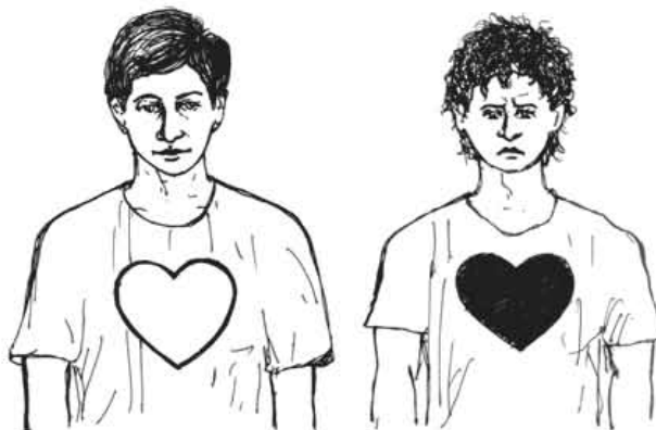
The relationship of the holiness of heart with of the face

Through this Jesus meant the owner is God Himself and the wheat is good people and weed is evil man, the land is the earth. The enemy is the Satan. In this earth there is co - existence of good and bad people. God does not want the destruction of the sinners; rather He wants the sinners to come back to Him changing their mind. That's why he waits and gives opportunity.