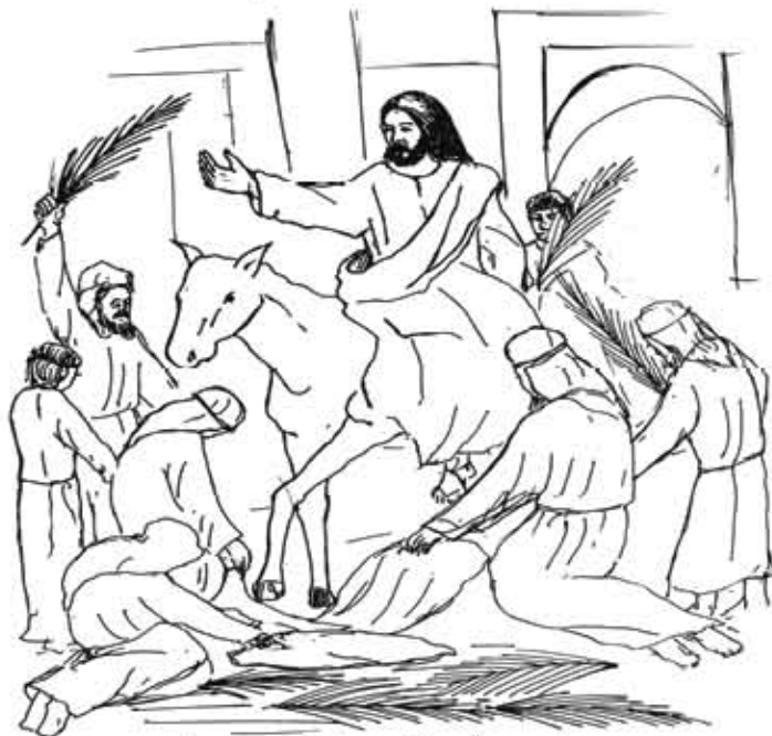
Jesus entering into Jerusalem

As the days of ascension were near Jesus took a firm decision to go to the holy city Jerusalem. He knew that He would be killed in this city. He told His disciples three times about it. By going to Jerusalem Jesus made a sign of His death, because all prophets had to be martyred in Jerusalem. It would not be an exception to Him.