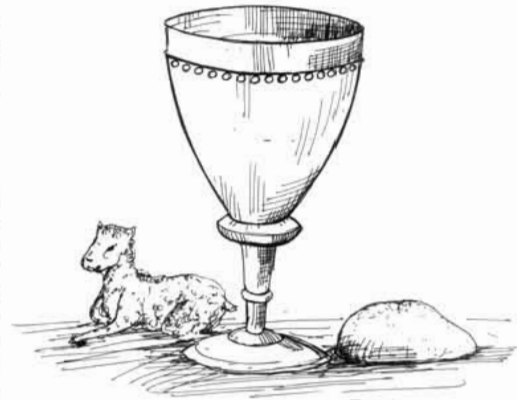
As fully God and fully human, Jesus Christ offered Himself

A human being has body, mind and soul. He/she is born with body-mind-soul and then gradually he/she grows up in human nature. God has created human being in a very special way different from other creations. He has given his/her intellect and will power which is not present in other things or animals. That is why human being is different from other animals.