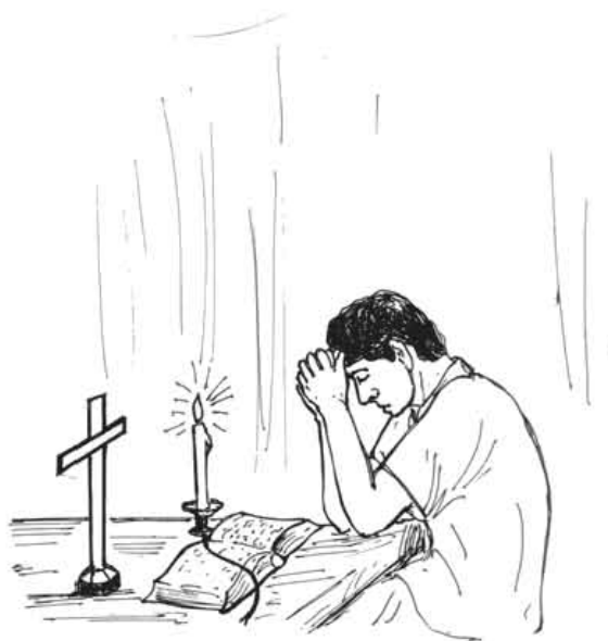
A repentant person

People can sin knowingly and at the same time stay away from sin also. That is why one has to first decide whether to sin or not to sin. Those who keep themselves steadfast to this decision, they can go a long way to holiness. And those who do not follow up with their decisions, it is mostly due to negligence. Others who do not take any decision not to sin, they lack awareness of sin. Here we shall discuss what sin is, its kind, and how to be saved from sin. This will help us grow in new awareness of sin.