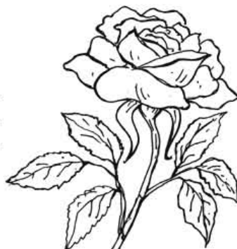
God's self revelation through His creation

got existence without Him" (John 1: 1-3). He has exposed Himself to the world through His creations.