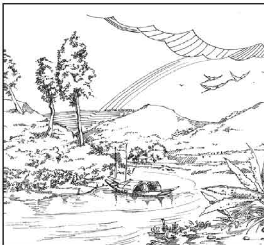
Picture of nature

How large this universe is! Our earth is only a small part of it. In this universe, there exist very large planets, stars, the Milky Way, Nebula and the Galaxy. All these are moving in a disciplined way. None of them goes beyond this system. Who has bestowed this system? How beautiful our earth is! There is a vast sky, wide fields, big hills- mountains, flowing rivers and streams, canals, seas and oceans. These were not created automatically. Who is the creator of all these?